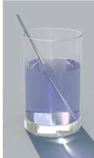
Refraction in normal water

Both scientists work at the University of Karlsruhe, and with their work they have added decisive momentum to the fields of three-dimensional photonic crystals and optical metamaterials. Unlike common optical materials or "normal" crystals, optical metamaterials display exceptional properties, such as a negative refractive index. This has far-reaching consequences for the use of these materials: "perfect" lenses can be produced in which diffraction does not limit resolution. This can lead to new lithography techniques for the fabrication of computer chips. Artificial materials functioning on the basis of light and produced with the aid of nanotechnology play a key role in information technology: their discovery often leads to huge advances in technology within a short time.