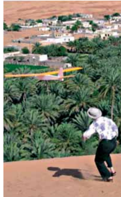
Top: Aerial photo of the Massirat mountain oasis in Oman.