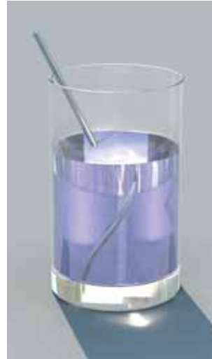
Refraction in "metamaterial water"

The contributions made to the theory of light propagation in structured materials by Kurt Busch's research team and the experimental approaches adopted by Prof. Dr. Martin Wegener's research group have considerably enhanced the possibilities for the production of three-dimensional photonic crystals. The physical properties of these artificially produced materials are unique: the intention is that one day they will enable researchers to build compact chips that function on the basis of light and can be used on the Internet, for example. "Light as an information carrier has two attractive properties: first, photons are almost always much faster than electrons, and second, two light beams can penetrate each other without mutual disruption", explained Prof. Dr. Martin Wegener. "This is not possible with an electrical current, since the charge carriers influence each other and produce short circuits."